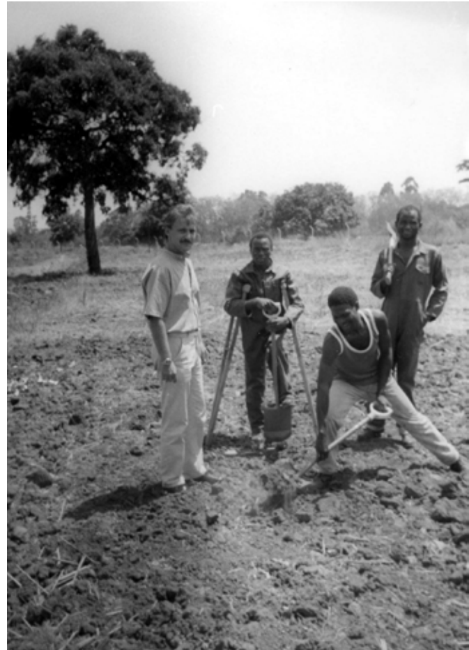
KEPA's work in Zambia has changed greatly since the Finnish Volunteer Service programme of the 1980s.

More recently KEPA's work in Zambia has concentrated on providing services for Finnish and local NGOs. KEPA has also been actively involved in development policy dialogues with Zambian organizations, aiming to highlight the needs of civil society.