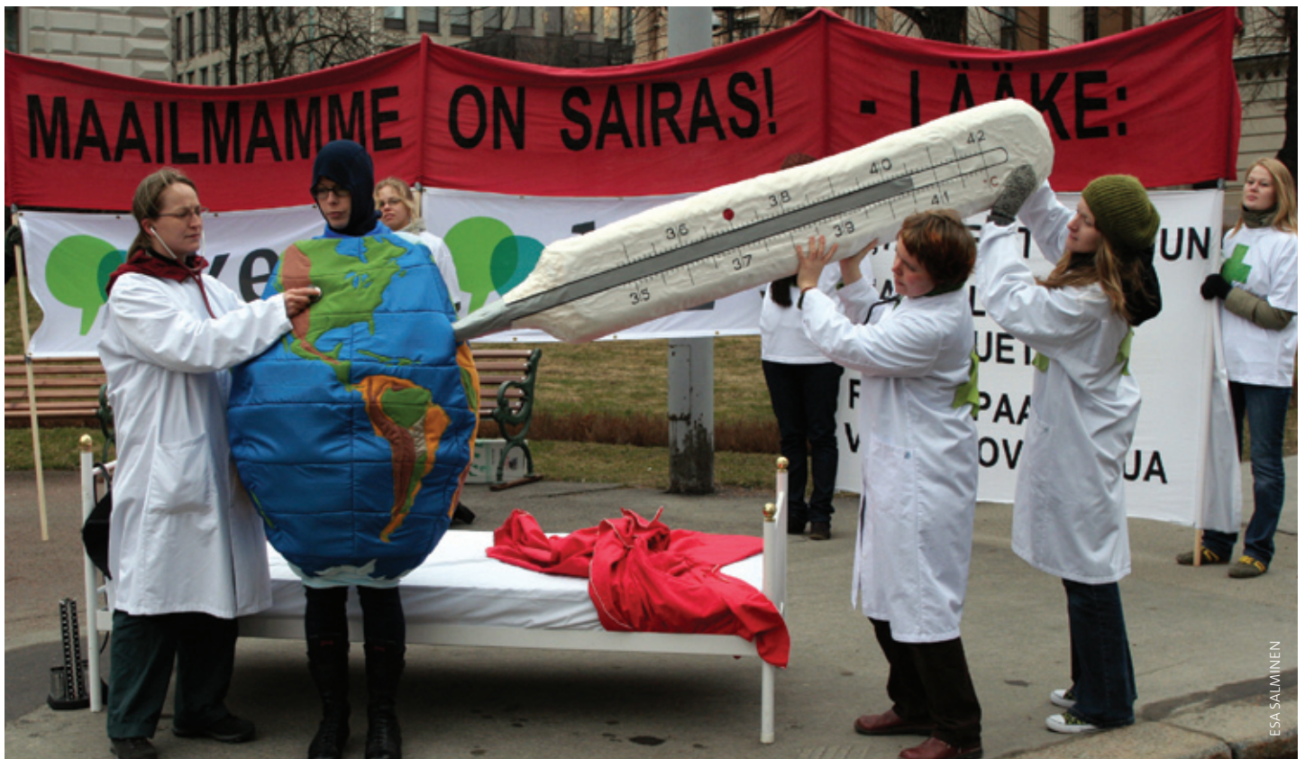
KEPA's election campaign urged the incoming Finnish government to do more to heal our ailing world.